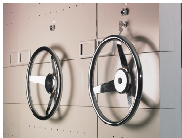
The mechanical drive system is robust and reliable