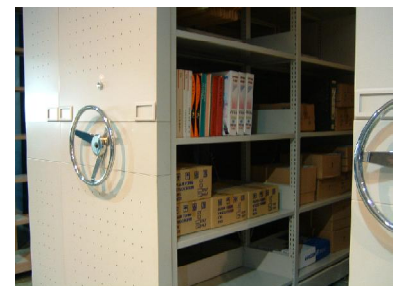
UDL per shelf is 100kg