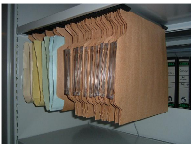
One of the accessories - Lateral Filing Frame

Rubber bumpers are provided to prevent noise due to metal to metal contact between bays